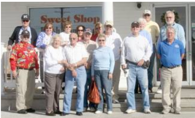
A group photo from the Bread of Life tour - Nov 2009

The back roads were beautiful this time of year. The farms with the horses grazing and the fall colors, what a gorgeous time to be in the Bluegrass. Our destination was 'Bread of Life Cafe'. The food, as usual, was delicious. Thanks to Diana Hanks for arranging this tour.