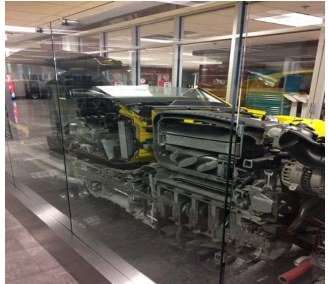
Cut in half, Saleen Mustang