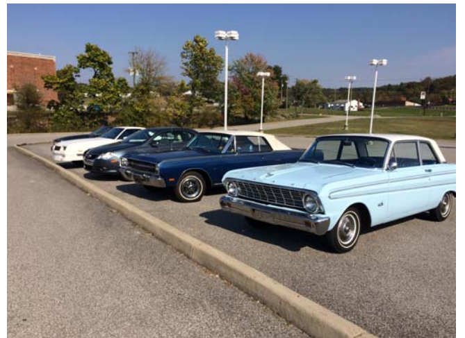
Fannin parking lot