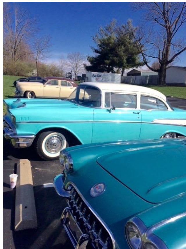
Three of the classic cars that joined the March tour.

The AH-000-GAH is the official document of the Bluegrass Region Antique Automobile Club of America, Lexington, Kentucky.